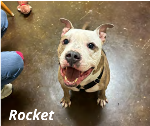
Blue and Rocket were constantly overlooked. You supported these underdogs until they found their forever family!

Imagine walking into the SPCA Cincinnati and there, among the eager faces, you spot a pair of eyes. They've seen so many people and animals come and go. They still hold onto hope that someone will choose them soon, but they've waited so long for their turn. All they want is to be seen, chosen, and loved.