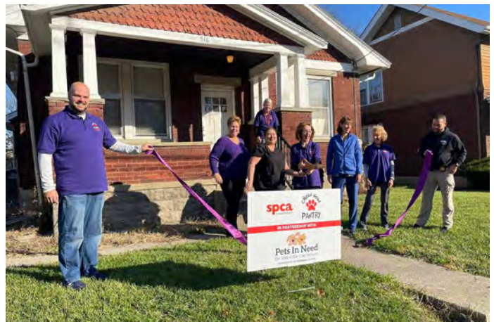
Thank you for helping vital programs like the Chow Now Pantry thrive!